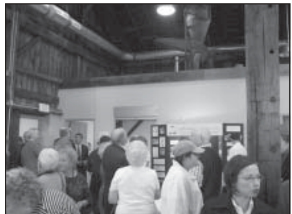
Staff and community members tour the barn/cafeteria, which has retained many of the barn's original elements.

The Alternate Learning and Career Center-East is a collaborative effort between LHS Family & Youth Services and the Lucas County Educational Service Center. The school offers an alternative educational program for students in Lucas County with severe learning, behavioral and/or mental health needs. It serves 20 to 30 students, who become part of a learning community where one-on-one attention and a focus on individual needs, together with a sense of belonging, help prepare them intellectually, physically, and emotionally for the future.