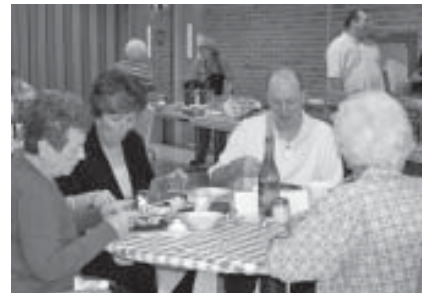
Residents, family, and friends gather for the spaghetti dinner.