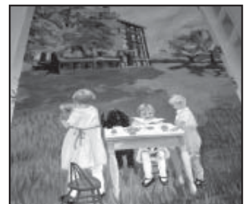
The spring mural that will hang in the new school.

In mid-June, a donor stepped forward to request that a series of murals be created depicting the old orphanage and orphans' lives. The donor asked that the murals be hung in the barn-cafeteria. Paula Nowicki, a local art teacher, agreed to lead the project. Four murals were created showing a season-by-season, era-by-era progression. Spring shows children having a tea party in front of the orphanage building. Summer shows children pushing each other in a "car"