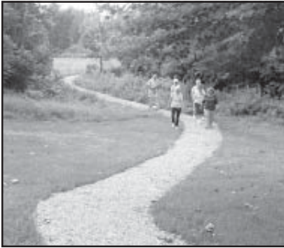
Residents walk the trail for exercise and relaxation.

Sunoco teams and contractors have helped the residents of Luther Grove, Luther Hills, and the nearly completed Luther Ridge independent senior housing communities to live healthier lives by giving them a new walkway along Otter Creek. The nature trail runs some 750 feet on the Lutheran Homes Society property at the corner of Wheeling and Seaman Streets, and will ultimately tie into a planned pedestrian bridge and several other walkways.