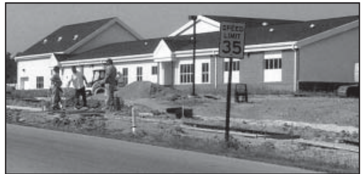
Construction continues on LHS Family & Youth Services' new school in Oregon, Ohio.

The new school being constructed on Lutheran Homes Society property near the intersection of Seaman and Wheeling streets is nearing completion. The school features "green" design and construction that reduces