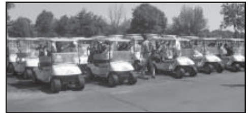
Golfers line up for the shotgun start.

Golfers participating in the twelfth annual Four Lutheran Agency Golf Outing, held August 1, had