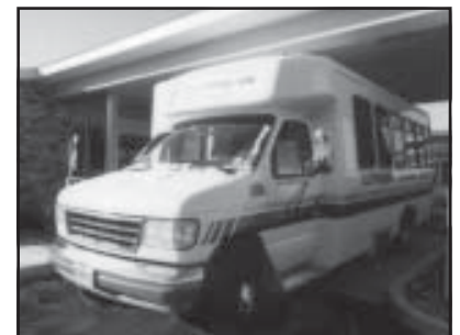
Lutheran Memorial Home provided bus transport to participants of the Venice Days celebration in Sandusky.

The celebration recognized the marker that was unveiled in the area to signify it as the former Village of Venice, which was incorporated into the city of Sandusky in 1963. Many of the residents still remember the village's elementary school that was located on the LMH grounds.