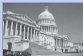
Capitol Building, Washington, D.C.

for both Medicaid and HUD. They shared concerns regarding long-term