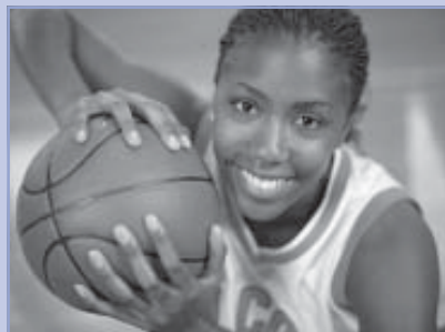
Success in sports often prompts positive change in other areas.