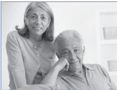
The AfterCare program helps patients connect to services after discharge.

AfterCare is a free service offered to LHS patients as they transition home from short-term stays for rehabilitation or therapy services at our rehabilitation centers at Toledo, Holland, or Napoleon. A referral is provided to one of the AfterCare coordinators from LHS Community Services, as a follow-up to the services arranged by each facilities' discharge planner or social worker.